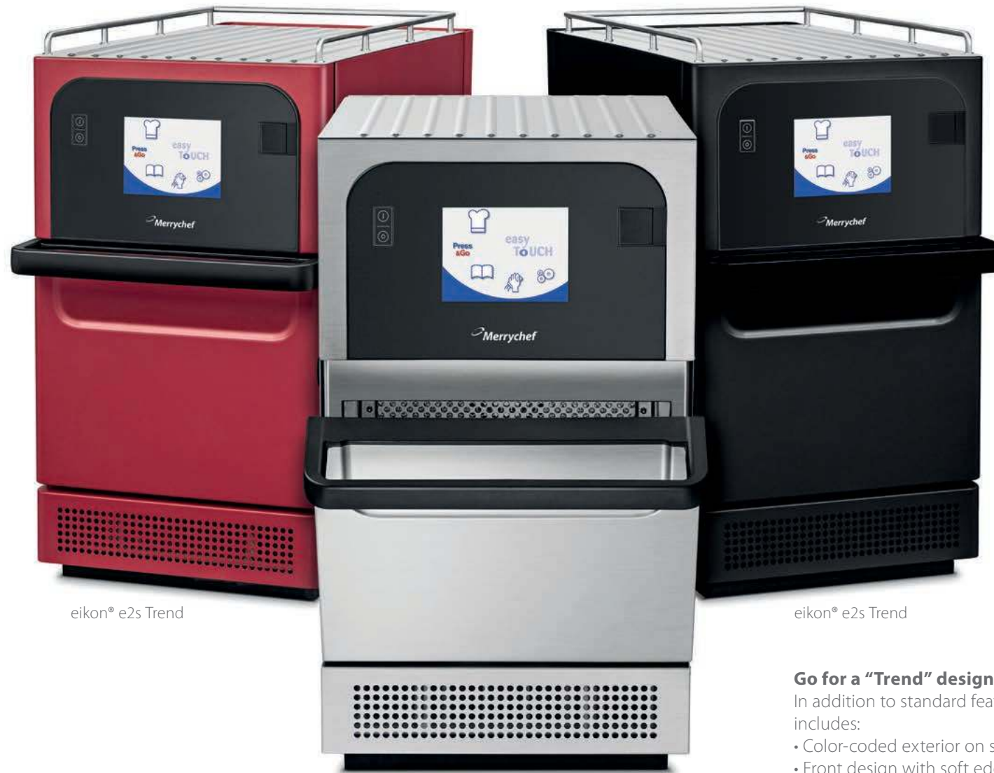
eikon® e2s Trend