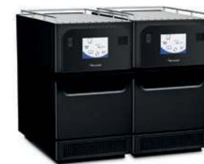
Adaptor for eikon® e2s Twin