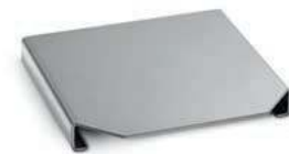
Flat cook plate