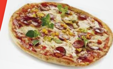
Pizza 50 sec.