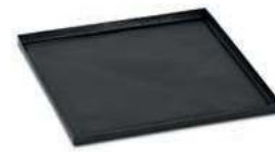
Solid base basket