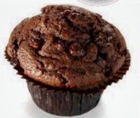
Reheated Muffin 30 sec.