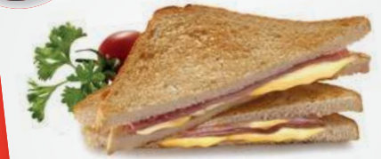
Toasted Sandwich 40 sec.