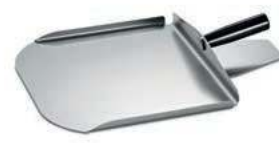
Guarded paddle with supporting side walls