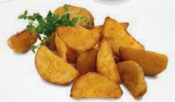
Wedges 60 sec.